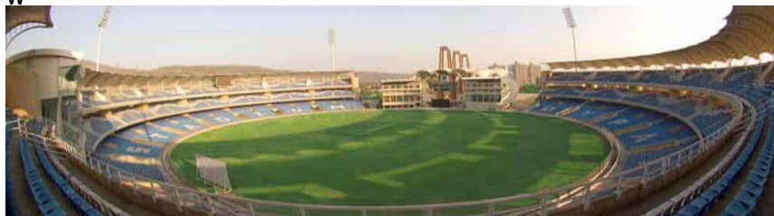
Dr. D. Y. Patil Sports Academy

The sister institution DYPATIL Sports Academy has modern well equipped integrated sports complex with seating capacity of more than 55000 and is the seat of all national and international games. It has a well endowed gymnasium, badminton court with w